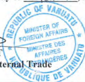
Honourable ALFRED R. CARLOT Minister of Foreign Affairs and External Trade

Made at Port Vila this 14 th day of March , 2012.