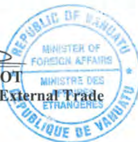
Honourable ALFRED R. CARLOT Minister of Foreign Affairs and External Trade

Made at Port Vila this 14 th day of March , 2012.